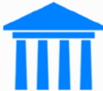
Corporate Law and Business Services