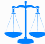
Estate, Financial, and Property Law Services