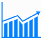
Financial Services and Asset Management